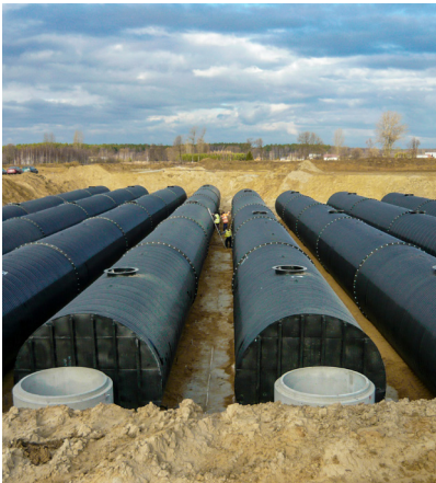
Earthworks, tightness testing, technical vehicle traffic, installation depth and similar information are described in the installation instructions. Please contact ViaCon specialists for the installation instructions.