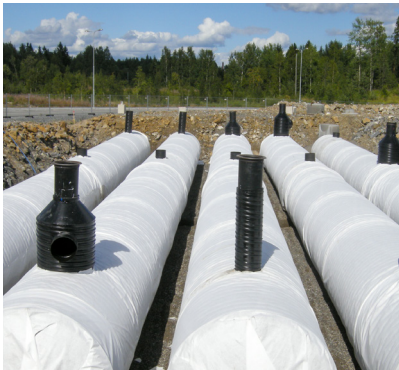
D2300 mm, L-9.80 m, V-40 m 3 , 1 pc.

When tanks are installed in the vehicle load area, no load distribution plate is required above the ViaCon StormWater, unlike plastic or fiberglass tanks.