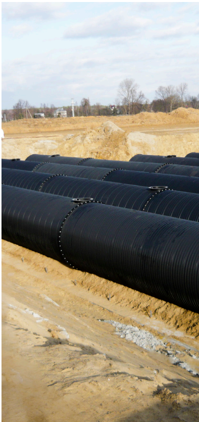
D3000mm, L-14,20m, V-100m3, 2 pcs.