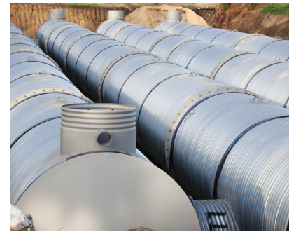
D3300 mm, L-10.00 m, V-86 m 3 , 2 pcs. and D3000 mm, L-5.20 m, V-37 m 3 , 1 pc.

Reservoir end caps and inside partitions are made of an analogous sheet metal used to make the tank body. The back cap is connected to the tank casing by an angle welding seam with a thickness of at least 3 mm. The tightness of the seam is checked by the penetrating paint method. In the event of the positive result of the leak test, the welds are protected against corrosion by a zinc-saturated paint coating and an additional polymer coating.