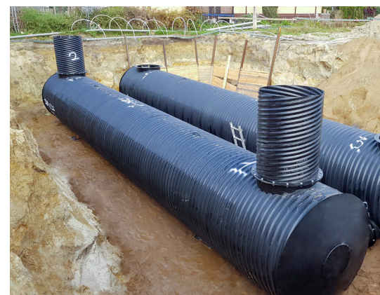
D3000 mm, L-13.40 m, V-90 m 3 , 2 pcs.