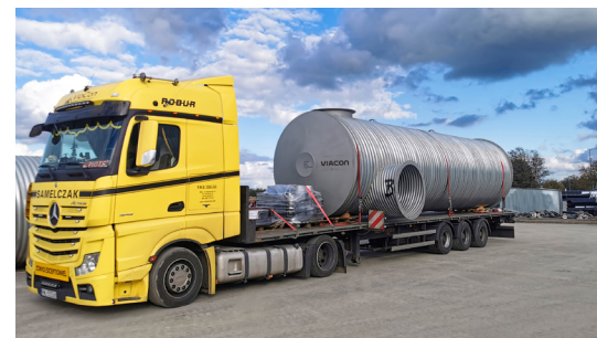
D3200 mm, L-23.70 m, V-190 m 3 , 1 pc.